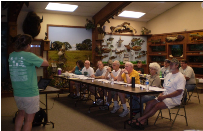
Lake Delhi Water Quality Team Members on Saturday, August 24th, very focused in a full day IOWATER Water Quality Testing Training Session.