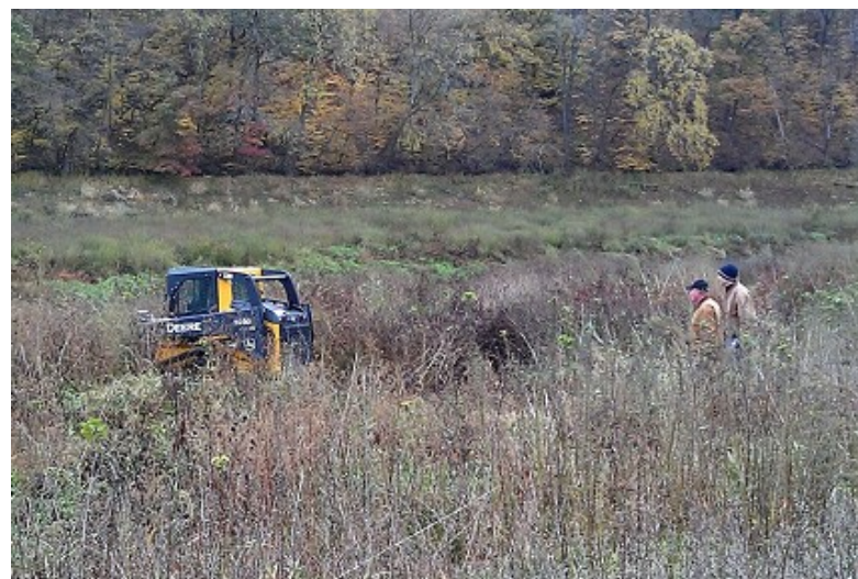
Miles of and thousands of Trees growing in the Lake Bed need to be cut down — See next page to get a better perspective