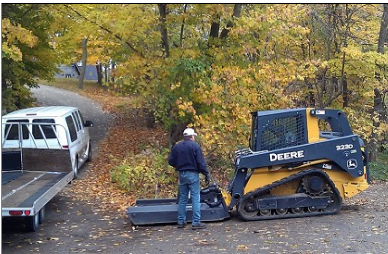
Hooking up the Tree Cutter to the Skid Loader

We have provided some photos of the work that was done to give you a sense of how much was accomplished. Great job Lake Delhi. We will need to do the same thing for the upper half of the lake in the Summer of 2014.