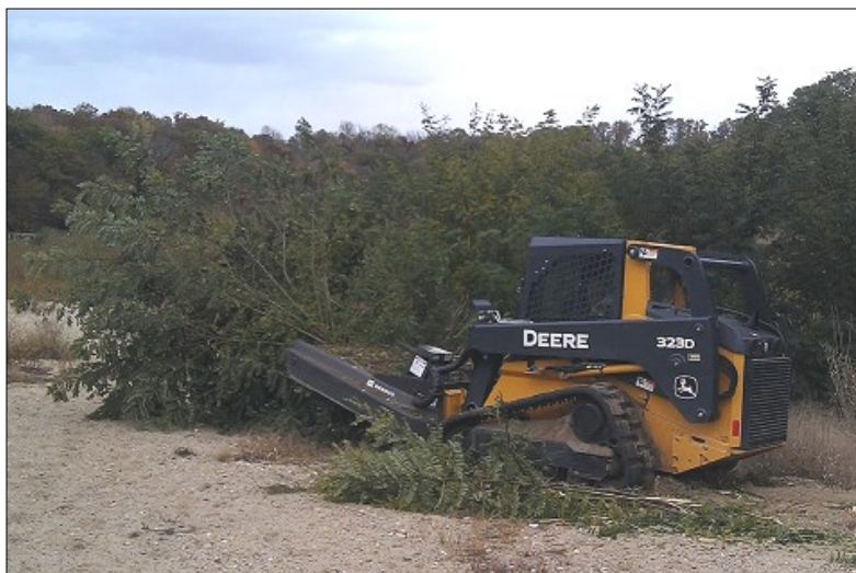
'Mowing' down a 18 foot tall Tree like cutting grass!