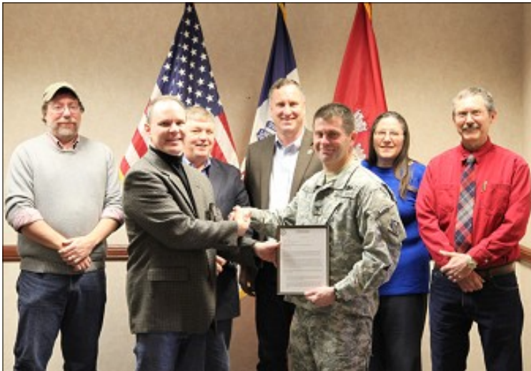
Lake Delhi Receiving our Federal Permit to begin Phase I construction

Lake Delhi took a huge step forward on January 31st, 2014. We received the Federal Permit from the Army Corps of Engineers to begin working on Phase 1 Construction of the Dam. The Phase 1 Construction Bid Package opening: 2/4/14.