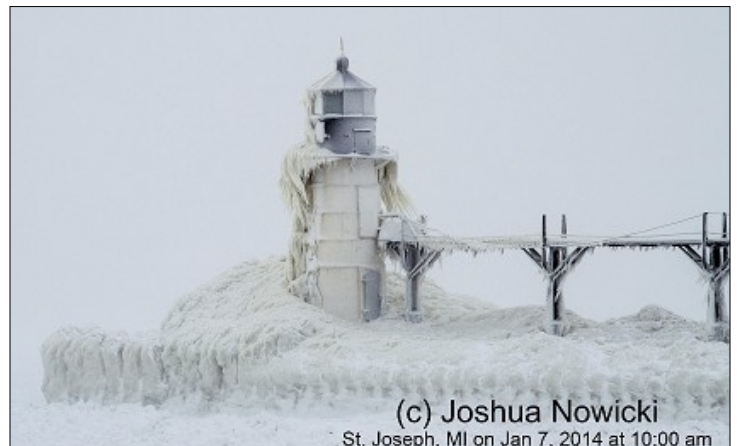
St. Joseph, MI on Jan 7, 2014 at 10:00 am