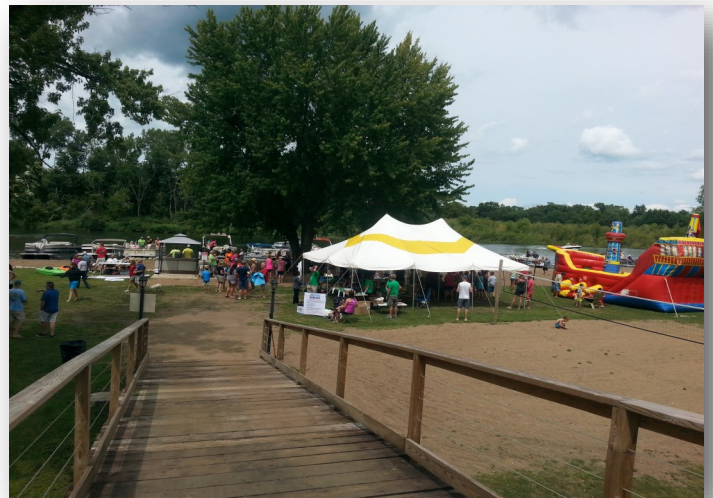
Lake's End location going strong at the 2017 Lake Delhi BASH Celebration Event

If you have great photos to share of the 2017 BASH Celebration event, send them to: LakeDelhiTrustees@LakeDelhi.org , and we may include them in the next VOICE Newsletter