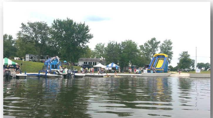
Cedar Cove "rock'in it" at the 2017 Lake Delhi BASH Event

With the assistance of our Lobbyists, Local State Legislators, and Bond Council, we were successful in passing a state law that allows the Lake Delhi Taxing District to refinance our debt, much like a city. Pictured is the final signing of the bill by Governor Branstad. The value to us is now Lake Delhi is able to refinance our debt at current lower interest rates, which will save our tax payers over $500,000 in interest costs for the remaining term of the debt. Since the passing of this law, the Lake Delhi District has successfully refinanced our bond that saves the District Taxpayers over $500,000 of interest & reduces our number of payments!