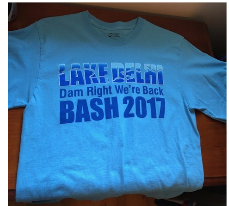
Bash T Shirt BACK