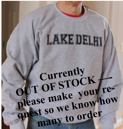
Men's and Women's Sweatshirt